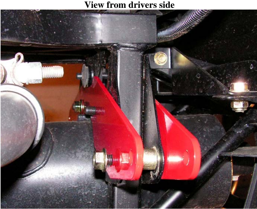
Diagram #4 View from drivers side

Position each of the long brackets per diagram #4 . Take one of the 10x60mm bolts and insert it thru the brackets in the factory shock location. Hold the sleeve in place inside the factory mount. Repeat this procedure on the opposite side. Using the supplied bolts, connect the two brackets in the middle two locations. Move the shock back into position, placing a washer on either side of the shock before installing the supplied bolt. Repeat on the other side. Tighten all bolts at this point.