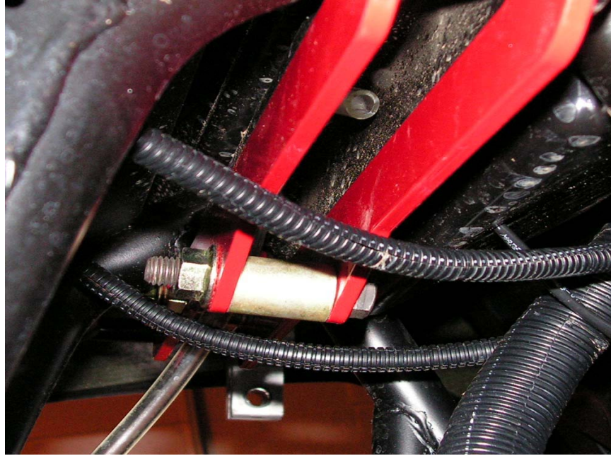
View from drivers side with shock reinstalled