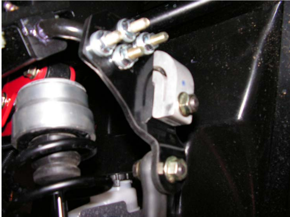
View of swaybar bracket