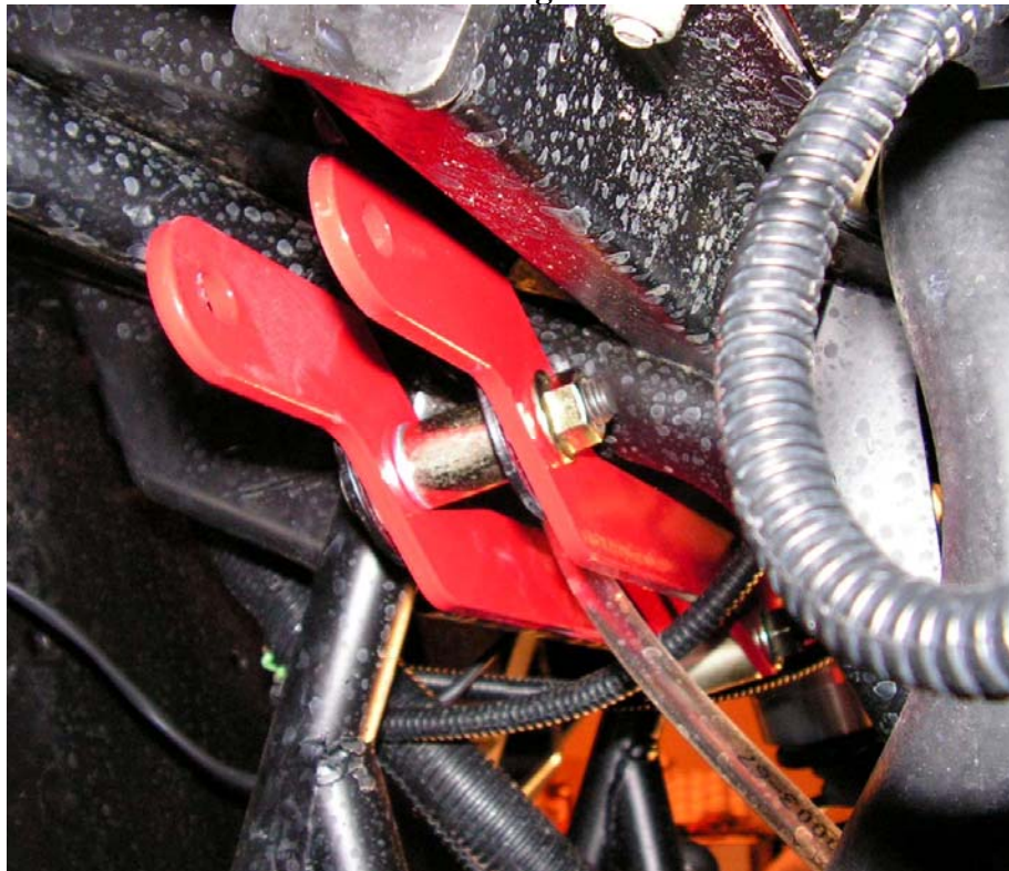
View from Passenger side